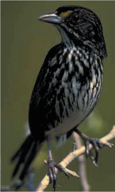
The dusky seaside sparrow became extinct in 1987.