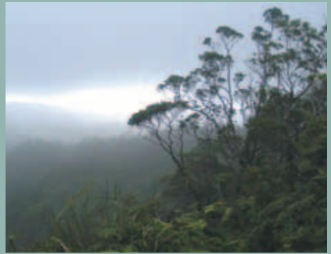
US Army Garrison Hawaii

After biologists in the FWS or NOAA Fisheries identify critical habitat, the agency publishes proposed boundaries in the Federal Register . 34 After receiving and considering public comments, the boundaries of the critical habitat area are finalized and protections for these lands begin. Critical habitat seeks to address the actions of federal agencies. Although private land can be designated as part of a species' critical habitat, private land is affected only if federal funds, permits, or participation is involved in an activity.