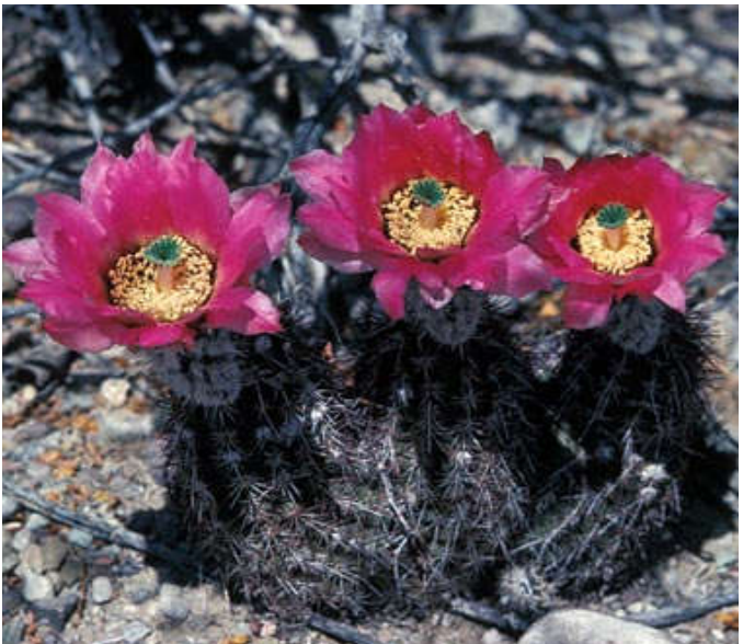
Chisos Mountain hedgehog

None of these creatures exists in a vacuum. All living things are part of a complex, often delicately balanced network called the biosphere. The earth's biosphere, in turn, is composed of countless ecosystems, which include plants and animals and their physical environments. No one knows how the extinction of organisms will affect the other members of its ecosystem, but the removal of a single species can set off a chain reaction affecting many others. This is especially true for "keystone" species, whose loss can transform or undermine the ecological processes or fundamentally change the species composition of the wildlife community.