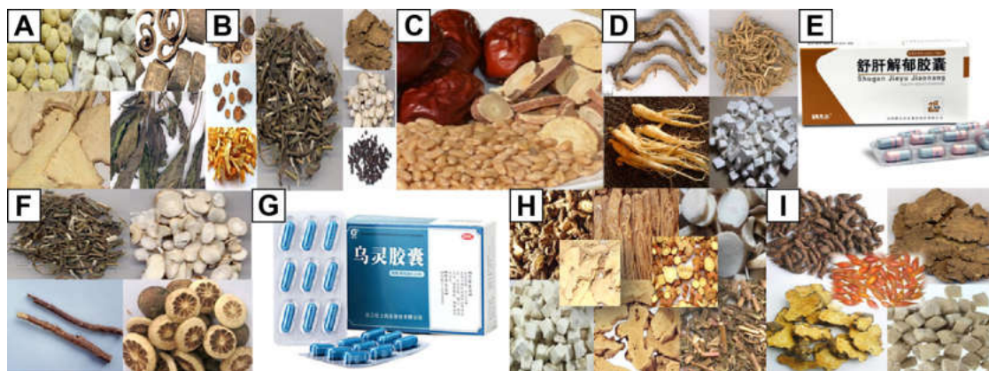
Figure 1 The nine formulas examined in this review.

suye were the core herb pairs to alleviate depression-like serotonergic and dopaminergic changes in mice. 33 Furthermore, aqueous and lipophilic extracts of BHD showed the greatest antidepressant effects, whereas the polyphenol fraction showed a moderate effect. 22 BHD reduced immobility time in the forced-swim test (FST) and tail-suspension test (TST), increased 5-HT and 5-hydroxyindoleacetic acid levels in the hippocampus and striatum, and decreased serum and liver malondialdehyde (MDA) levels in mice with a depression-like phenotype. 34 Ethanol and water extracts of BHD reduced c-Fos expression in cerebral regions of rats subjected to chronic mild stress (CMS) to a level comparable to that of fluoxetine. 35 BHD significantly