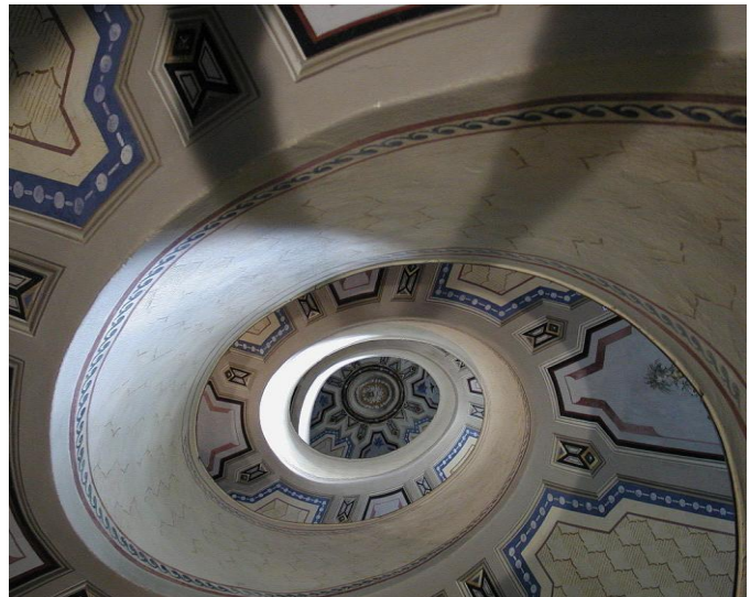
Fig 3. Spiral Stairs by Giacomo Vignola

Another prominent architect is Giacomo Barozzi da Vignola. Giacomo was an Italian architect key to the revival of the classical era after the doom faced by the Roman Empire. His works such as the Villa Farnese in Capraola the construction of a church in Rome, the Jesuits' Church of the Gesu, helped return the vibrancy of architectural design that had faded in Europe (Frampton & Futagawa 51).