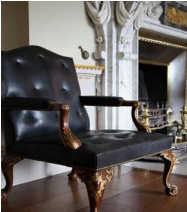
Fig 6. Classic Leather chair from the 18 th Century used nowadays in household reception areas.