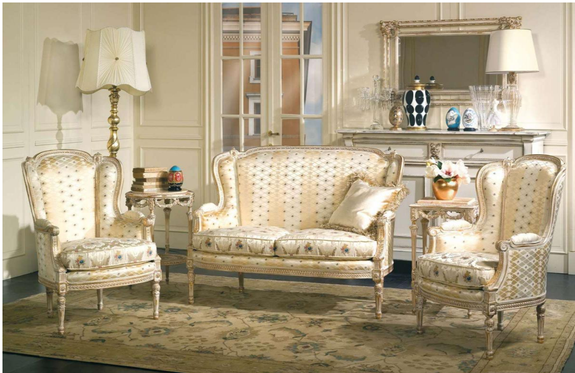
Fig 4. Sandy colour adds elegance and luxury to the whole room.