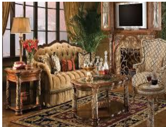
Fig 5. A modern enactment of the Classic Era.