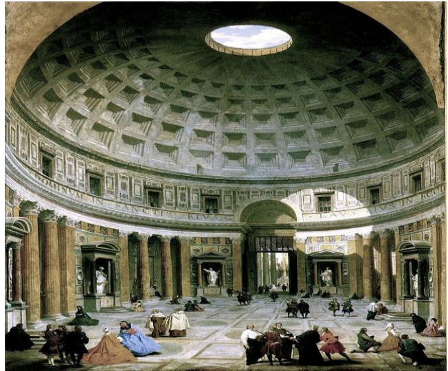
Fig 2. The interior of the Pantheon (from an 18th-century painting by Panini). A heritage of Vitruvius designs after his death

First, I would start by discussing the founder of this design of architectural construction and this, as stated earlier, is Vitruvius. Vitruvius was a famous Greek architect upon whose works the classical era in architectural design developed. Upon studying the resource De architectura by Vitruvius, one can understand the ancient Greek construction designs. This understanding together with the remains of the former Roman Empire, make it clear to stake what the classical era in architectural construction presents. Therefore, architects can develop it further through such means like those applied following the collapse of the Roman Empire (Serlio 22).