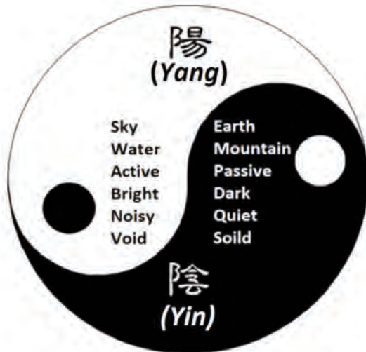
Figure 1. The harmony between yin and yang.

Shui rules are somehow unreasonable. Most of the Chinese do not admit that they practise Feng Shui based on superstition but in fact humankind just needs a way to sustain healthily. According to Xu (1998), treating anything that is partly understood as superstition is not a scientific manner of finding truth. Feng Shui may have supportive values for physical and mental well-being in a practical way rather than strictly superstition. Teather & Chow (2000) highlighted that Feng Shui is connected to human well-being by its visual-psychological implications. It induces environmental planning in accordance with human subjective feelings about, especially essential in a sleep environment.