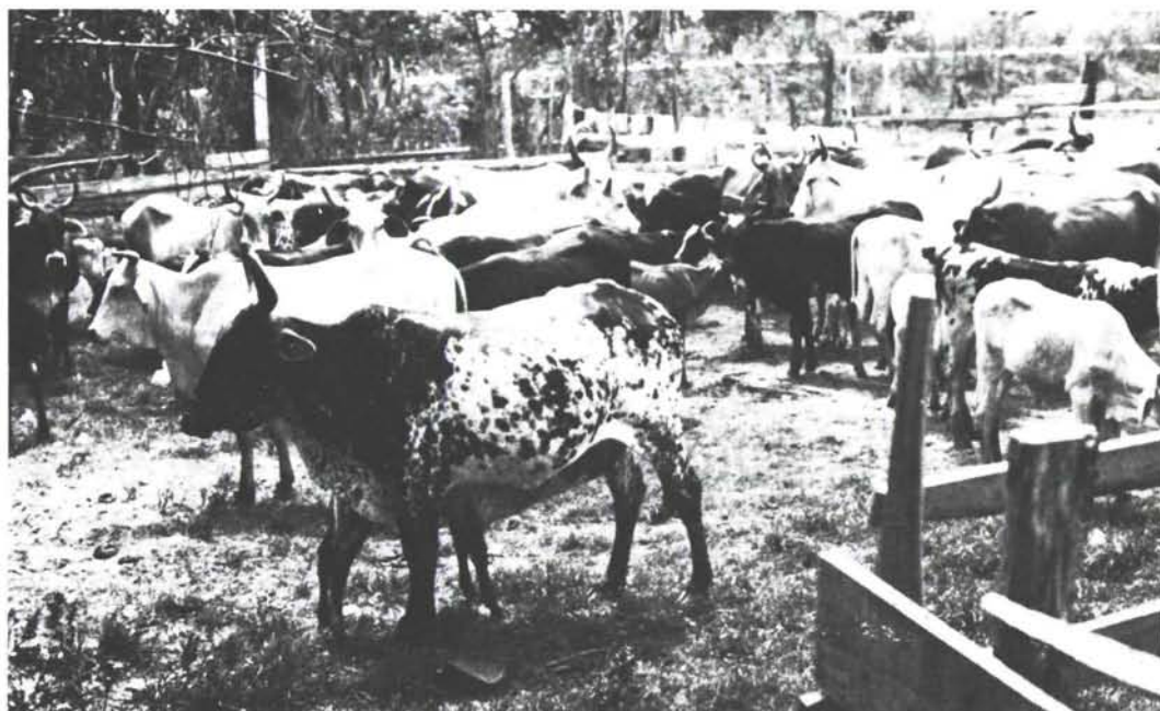
Typical "dairy" animals in Peru.

transfer of kit technology requires the training of recipient laboratory personnel in the use of the kit and instrumentation, as well as the interpretation of quality control and test data. The principal function of the Unit in this respect is to technically assist the Joint FAO/IAEA Division in the delivery of training.