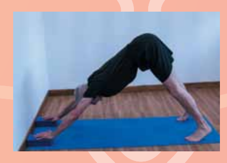
Figure 16: Downward dog (Adho mukha svanasana) with blocks. For patients who find it difficult to push down through their hands.