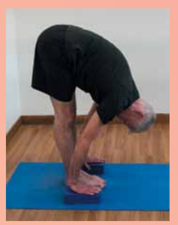
Figure 13: Forward bend (Uttanasana) with blocks. The use of blocks reduces the intensity of the stretch.

This exercise can also be performed as a partner action. For this your partner stands behind you, grips in