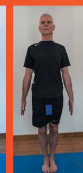
Figure 3: Mountain pose (Tadasana)