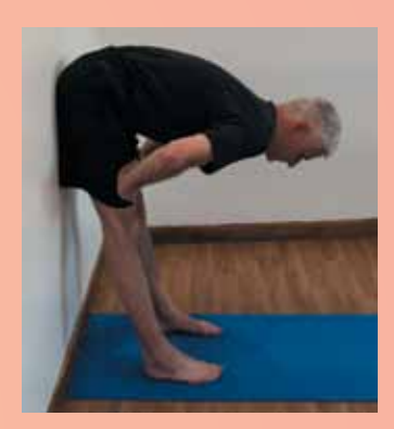
Figure 14: Assisted Forward bend (Uttanasana). Individuals with impaired balance can perform this stretch against a wall.