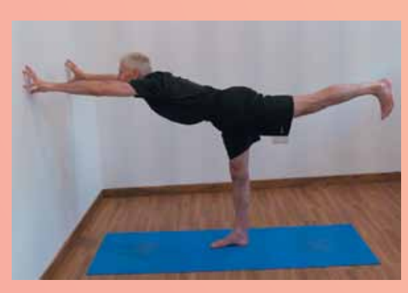
Figure 12: Assisted Warrior III.