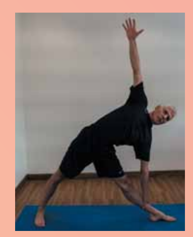
Figure 6: Triangle (Trikonasana).

The Triangle pose requires a combination of leg firmness and