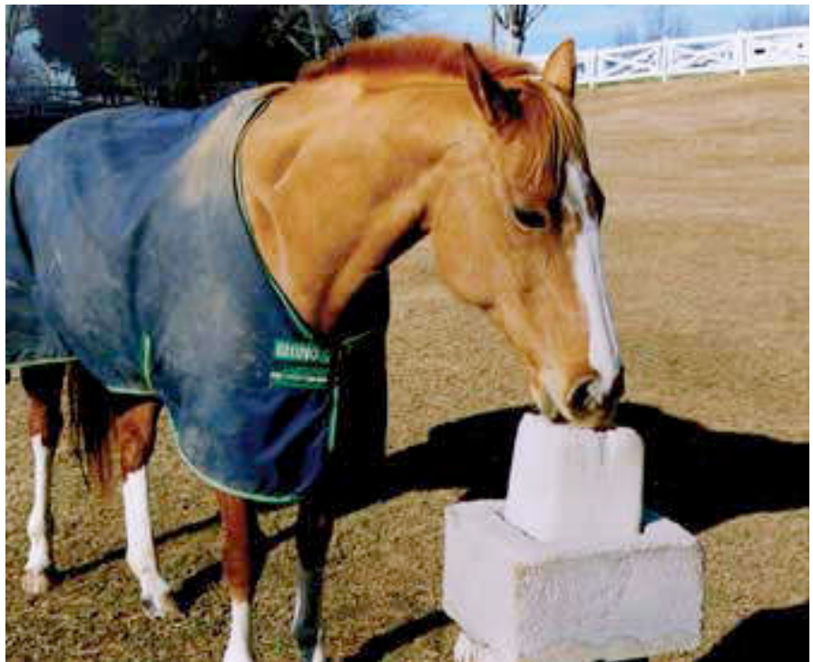
Horses enjoy special treats, such as carrots or alfalfa cubes.