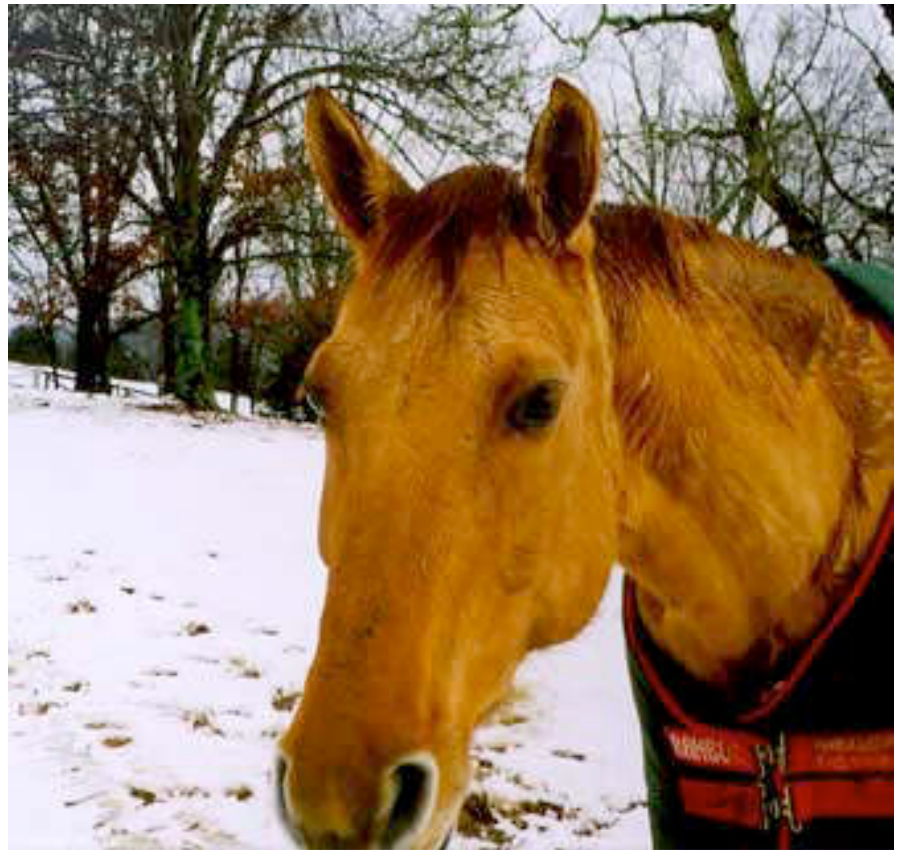
A horse can amplify and pinpoint sound with its ears.