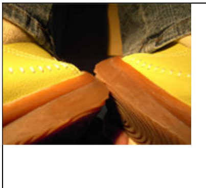
Testing the leg length

The therapy has no side effects; the patient may feel a warm tingling sensation in the legs. At best slight temporary muscle soreness occurs after treatment because the structure of the body is new.