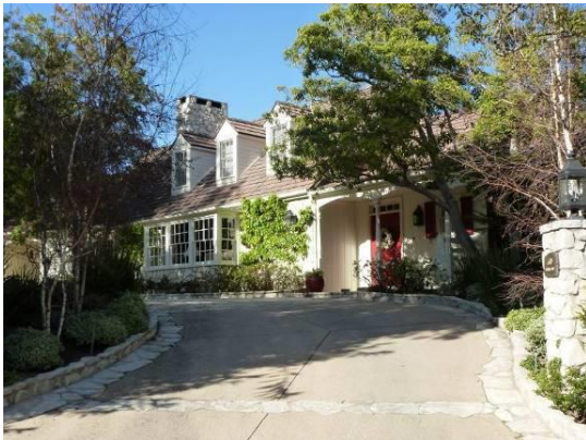
Residence at 600 North Funchal Road, constructed in 1949 (SurveyLA)

Late American Colonial Revival style buildings feature clapboard or brick exteriors, simple building forms, and side-gabled roofs, often with boxed eaves. The roofs may have multiple dormers. Buildings are typically one or two stories in height. Details may include stylized door surrounds; paneled front doors, sometimes within a recessed entryway; multi-paned double-hung sash windows; and fixed shutters. Unlike earlier versions of the style, the classical detailing of the Late American Colonial Revival style is simplified to merely suggest colonial precedents rather than mirroring or reproducing them.