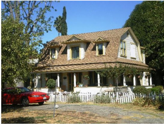
Taft House, constructed circa 1895

The style was less popular in Los Angeles than its American Colonial and Georgian Revival counterparts, though it can be found throughout the city in areas that developed around the turn of the century. Early examples of Dutch Colonial Revival architecture often blend it with influences of the Shingle or other Victorian era styles. A case in point is the Taft House (LAHCM #622) in Granada Hills. Constructed circa 1895, it is a quintessential example of the style. It displays the gambrel roof so closely identified with the style, as well as wood siding and dormer windows, while its columned porch partially wraps around the first story in a manner reminiscent of Queen Anne