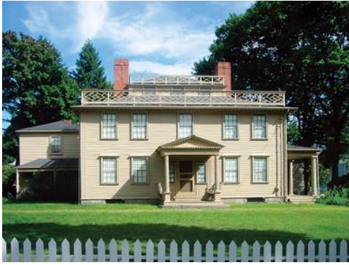
Quincy House, constructed in 1770

Context: Architecture and Engineering; Theme: American Colonial Revival, 1895-1960