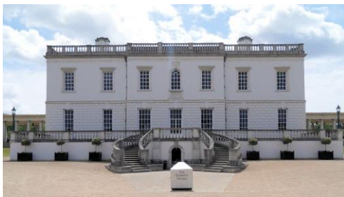
Queen's House, constructed between 1616-1635

Architecture in seventeenth and eighteenth century America took its cues directly from English architecture of the same period. Though the majority of buildings were constructed of wood, some of the most substantial ones were built with brick. Initially inspired by Tudor and Medieval architecture, even the earliest extant brick houses in Virginia display stripped down versions of Classical detailing, such as symmetrically arranged façades and the use of pediments and columns (or the suggestion of columns) around main entrances, as seen at Bacon's Castle (ca. 1655). 1