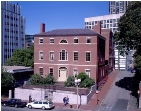
Harrison Gray Otis House, constructed in 1796

Even after the Revolution, Americans continued to follow European fashion and culture. This period saw the rise of the first professional architects in the United States, such as Charles Bulfinch and Benjamin Henry Latrobe. They frequently turned to the architecture of Englishman Robert Adam for inspiration. Adam's designs continued the tradition of Palladian box-like forms and temple-like façades, but he added delicate and more elaborate detailing than previously seen. 7