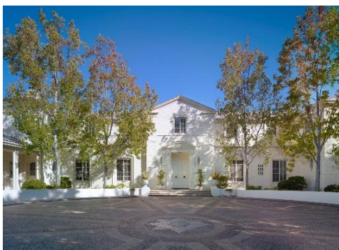
Jay Paley/Hilton Estate, constructed in 1936 (Burning Settlers Cabin)

Georgian Revival buildings are generally clad in brick, two stories in height, and have symmetrical façades that are often five bays in width. They are rectangular in form with a hipped or gabled roof. The main entrance may be dominated by a pedimented projecting pavilion supported by pilasters or columns, Decorative elements may include a central dormer with a pediment. Windows are typically divided-light double-hung sash windows, and Palladian windows are also frequently seen.