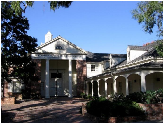
Thirty-Sixth Church of Christ, Scientist, constructed in 1949 (SurveyLA)

Context: Architecture and Engineering; Theme: American Colonial Revival, 1895-1960