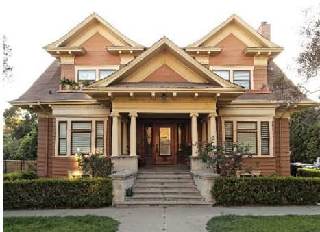
Toberman House, constructed in 1907

Buildings constructed in the Early American Colonial Revival style are typically one or two stories in height, symmetrical in design with the entryway as the primary focus, and have hipped or gabled roofs, most often with boxed eaves. They feature simple classical detailing, sometimes with exaggerated proportions. They usually have clapboard or brick exterior cladding; multi-pane double-hung sash windows, frequently with fixed shutters; and paneled front doors, sometimes with sidelights and transoms. Other design details may include pediments, columns or pilasters, and multiple roof dormers.