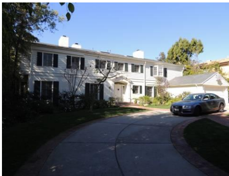
Stedman House, constructed in 1936