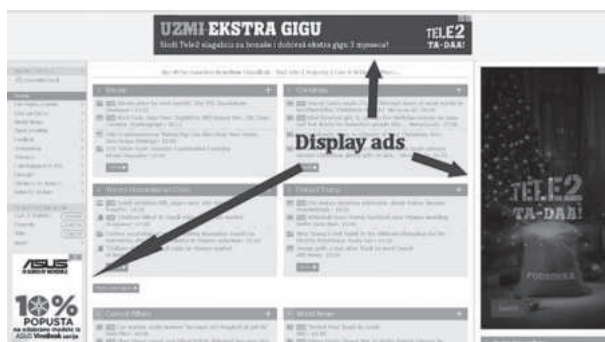
Fig. 2. Example of a display ad

According to [4], display advertising is a digital version of jumbo posters or TV ads, and it is used for websites users visit. Companies pay inventory to attract as many potential customers as possible. There are two ways to do that, i.e. by buying ad space from the website owner or by using affiliate networks for companies with different sites promoting ad slots. An ad can be displayed on specific web pages, to an individual website visitor, or both. Like other digital lithographic forms, display advertising platforms offer many options for targeting users. One of the options is to show your ad to the specific speaking area or at a particular time of the day. For example, it is possible to have an exact selection of ad placements by selecting a specific website or specific areas on that website where the ad can appear. Display advertising has many options in defining ad layout. For example, banner ads come in all shapes and sizes, video ads use motion and sound, while Gmail ads are interactive and expandable ads at the top of a user's inbox. An ad banner example is shown in Figure 2.