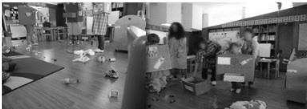
Figure 2. The eco-colorful.

The kindergarten educator, along with the kindergarten educator student, performs a play for the group of children on the theme recycling bins (Figure2).