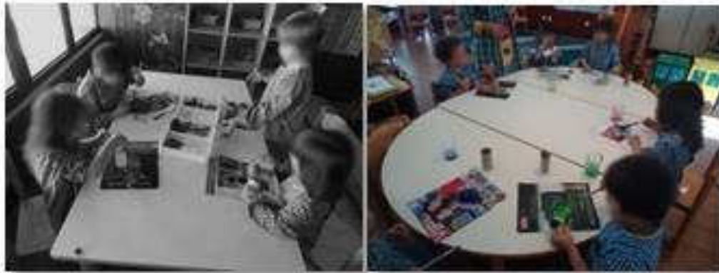
Figure 3. Recycling Train: building toys.

Through painting, stamping, collage and creativity children reused some waste/ rubbish and built their toy (Figure 3).