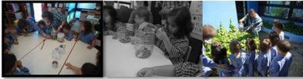
Figure 4. The little digesters.